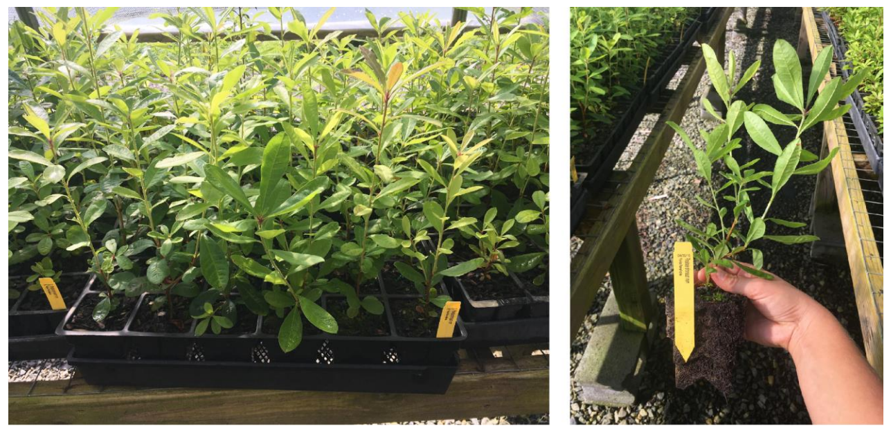
Figure 6. Rhododendron austrinum liners, Sept 4, 2018. Transplanted on April 20, 2018.

The next spring, azaleas are transplanted in the same manner to 3-gal containers. We hedge trim the blocks one more time before preparing plants for transplant. We have used both squat pots and standard 3-gal with success. Three-gal containers receive a topdressing of 38g Polyon® 16-6-11 CRF, and again 2.5 cm (1 in.) of rice hulls. The pots are spaced about a foot apart on all sides.