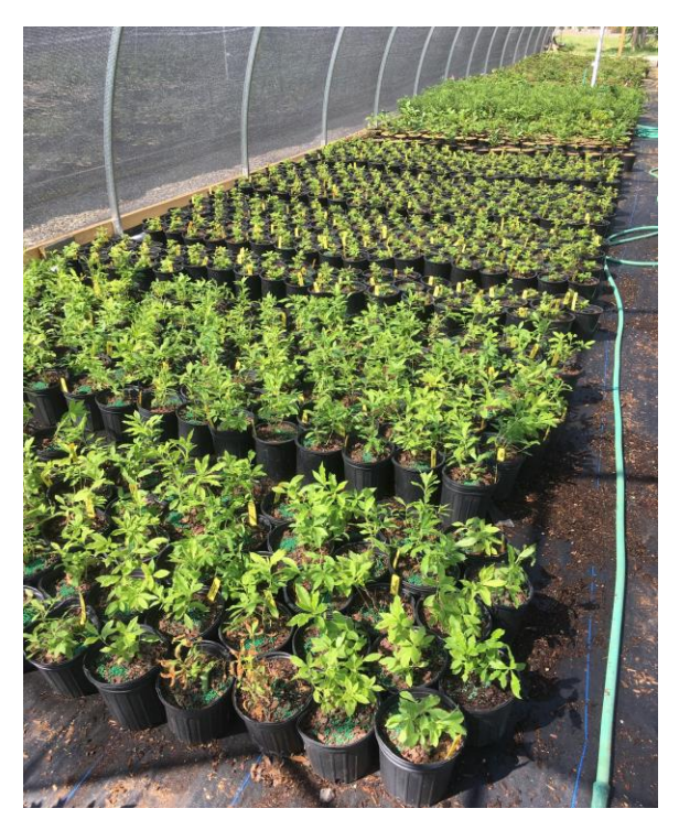
Figure 7. Bed of 1-gal Rhododendron atlanticum , June 12, 2018. Seedlings were transplanted March 22, 2018.

Three-gal plants may be hedge trimmed once after blooming, if needed. We make a pass through 3-gal crops in June or July to hand-prune branches growing at strange angles.