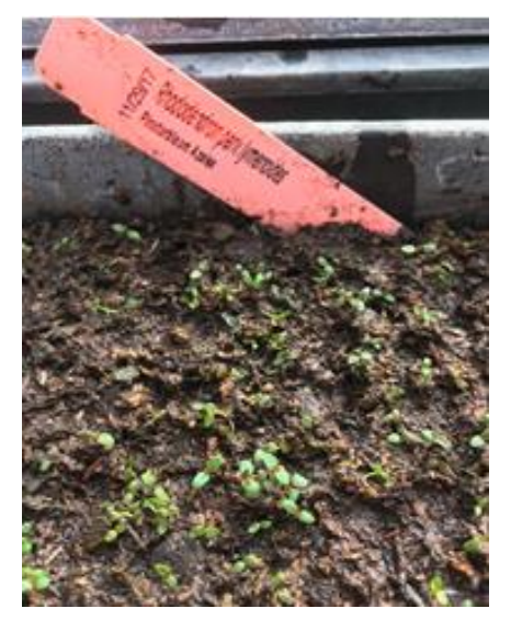
Figure 2. Rhododendron periclymenoides seedlings in flats in early January after being sown in November 29, 2017.

When germination has clearly begun, we begin our maintenance schedule which involves weekly drenching with products to provide fertility and protect against pests and diseases (Figure 2). Fungus gnats and fungal diseases are the main pests that we worry about during this stage.