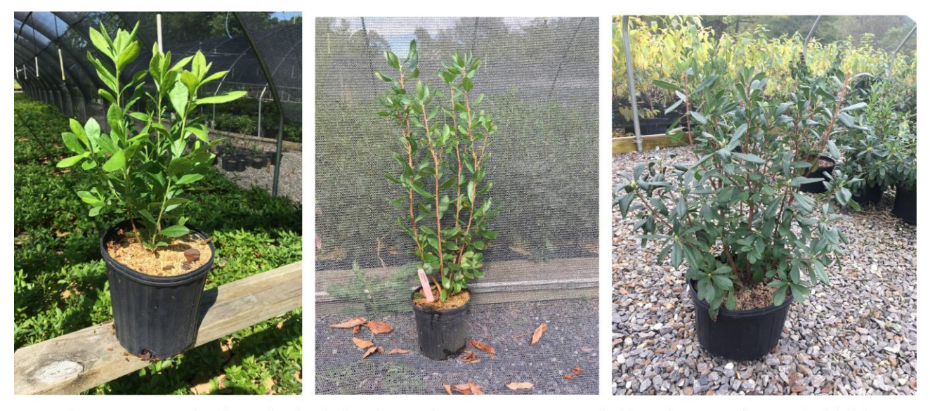
Figure 8. Growth of 1-gal Rhododendron atlanticum on June 6 (left) and September 28 (middle); seedlings were transplanted on March 22, 2018. Growth of 3-gal Rhododendron atlanticum on 26 September 2018 (right); seedlings were transplanted on 15 March 2018.

Azaleas transplanted into threegallon containers in March or April can be expected to be fully rooted and sellable by mid-August through September (Fig. 9). In this manner, we can produce a finished crop of three-gal azaleas from seed in three growing seasons.