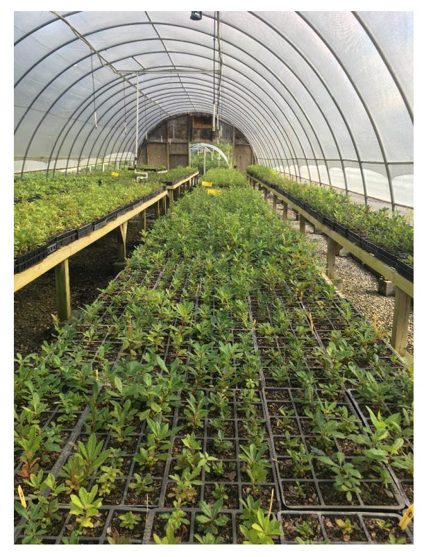
Figure 5. Azalea liners in propagation house, September 2018.

Once a block of seedling transplanting is complete, we drench with Actinovate ( Streptomyces lydicus strain WYEC 108) or a similar biological fungicide. If transplanted by the first of May, seedlings can be expected to fully root into cells before the first of September (Figure 5). We use a hedge trimmer to prune the seedlings back to a consistent height about two months after transplanting, when lots of active growth is present. We repeat this trimming 2-3 more times throughout the season to encourage branching.