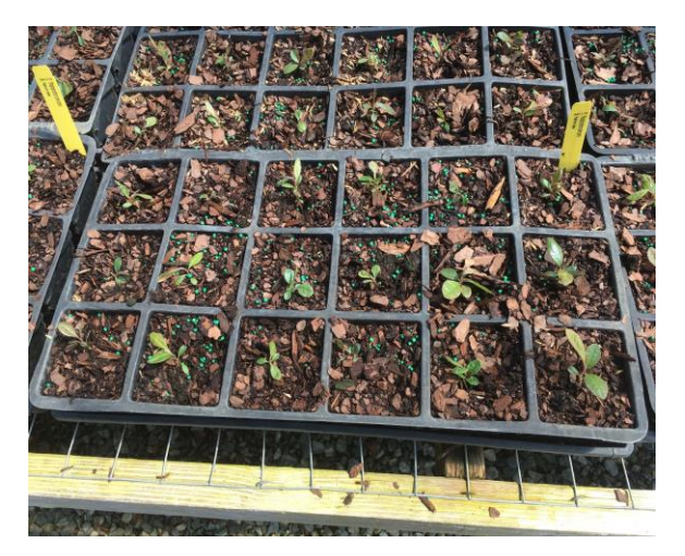
Figure 4. Freshly transplanted Rhododendron canescens seedlings, April 1, 2018

Seedlings are taken from the flats in chunks and carefully separated to preserve the roots. We have built ourselves a dibble board with wooden dowels, which we press onto the flats to make the necessary holes in each cell to plant into. Transplanting seedlings at the correct depth requires some skill (Figure 4). Each tiny plant needs to be placed no deeper than it was originally growing in the flat, but not so high in the cell that the small plant flops over when watered. We generally assign this task to our most skilled workers - because so much of the quality of our future crop depends upon this step. Once each flat is complete, we sprinkle 20 grams of Harrell's Polyon® 16-6-11+ micros-controlled release fertilizer (CRF) evenly over the entire flat, and water thoroughly by hand.